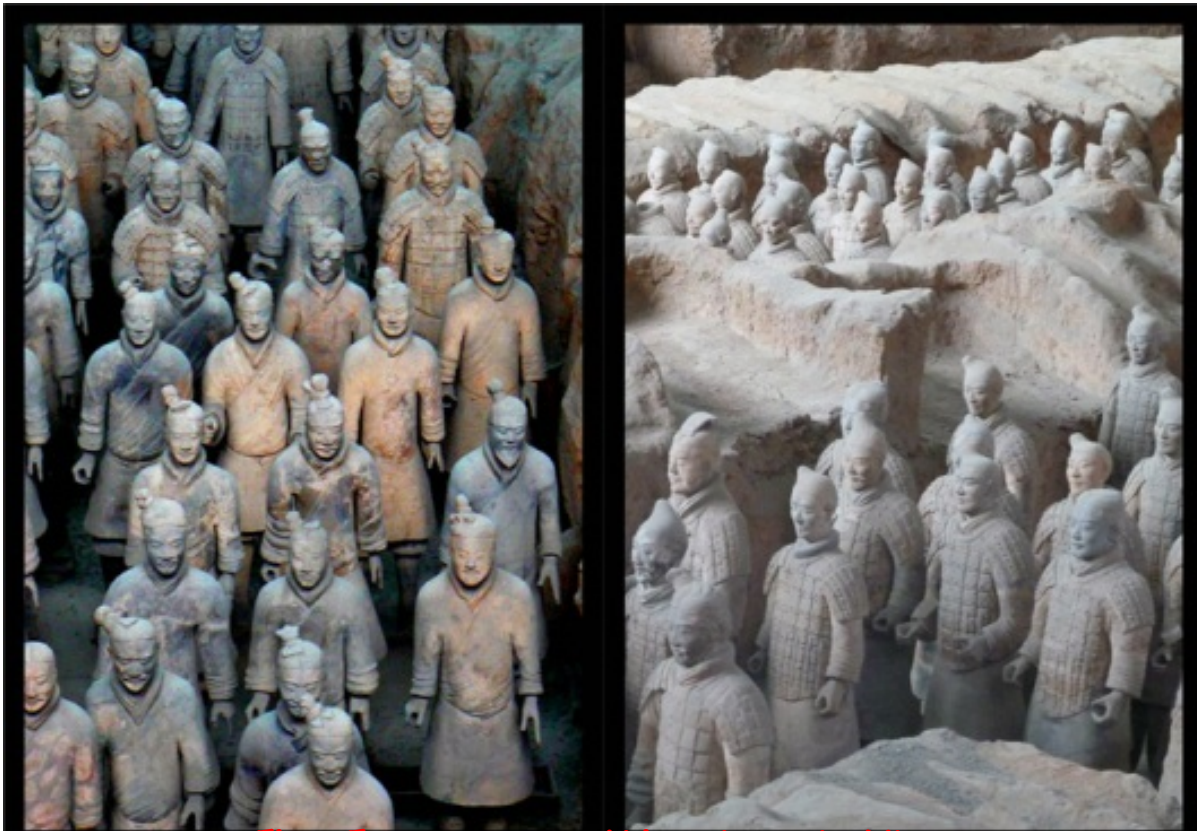
The Terracotta Warriors in Xian