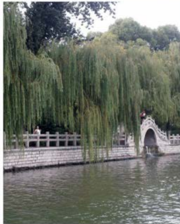
Chelsea Rose & Emma Knight visiting a beautiful garden in Xian