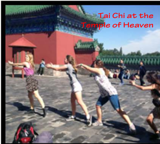
Tai Chi at the Temple of Heaven