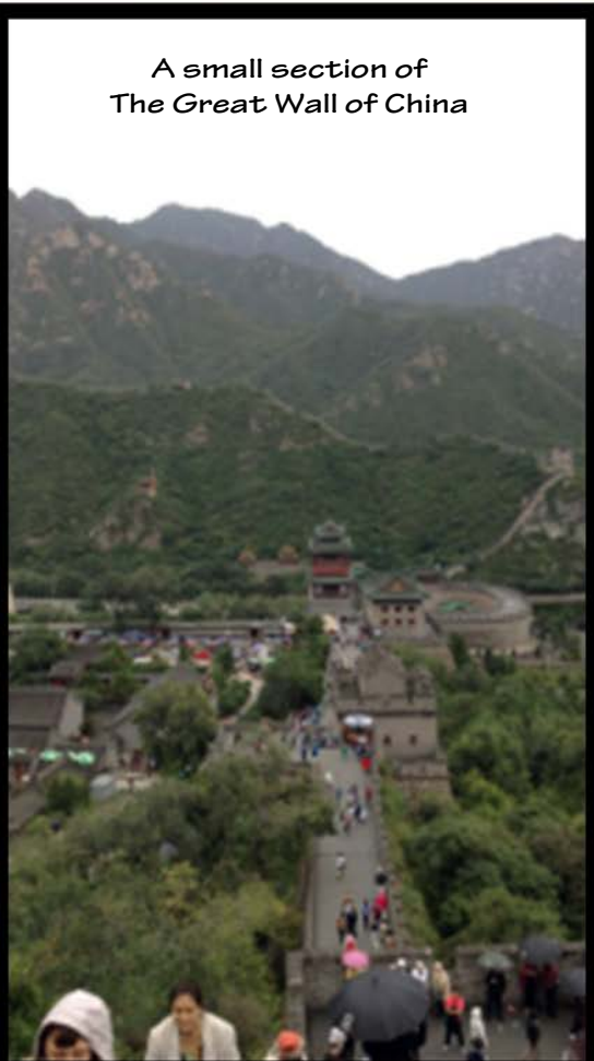
A small section of The Great Wall of China