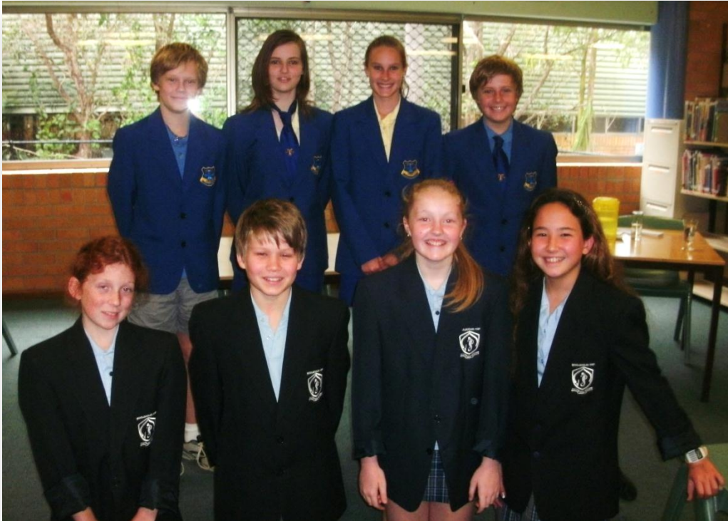
Our Year 7 debaters with their opponents from Woolgoolga High School