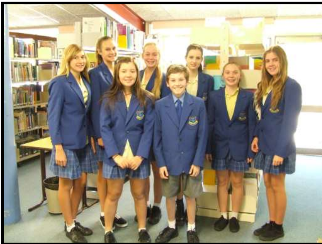
Years 7 and 8 Debating Teams